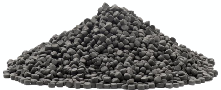
Figure 2: MIM Feedstock