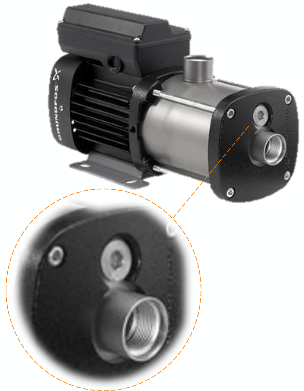
Figure 3: CM Pump with MIM Plug